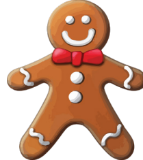
chicha yammi pallaska