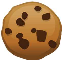
pallaska chapoli chipita