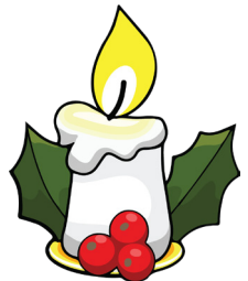
ná akmo palah