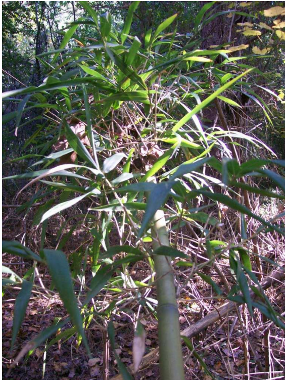
Figure 1. Giant cane ( Arundinaria gigantea ). Photo taken on tribal lands of the Mississippi Band of Choctaw Indians, taken by Tim Oakes, 2011.

Contributed by: USDA NRCS National Plants Data Team, Greensboro, NC