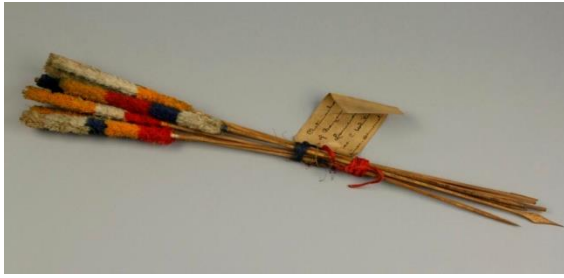
Figure 4. Chitimacha blowgun darts of fire-treated split cane. Courtesy of the Department of Anthropology, Smithsonian Institution E76807.

Young shoots were cooked as a potherb and ripe seeds were gathered in the summer or fall and ground into flour for food (Morton 1963; Hitchcock and Chase 1951). Flint (1828) says of a subspecies of giant cane, Arundinaria gigantea ssp. macrosperma : “It produces an abundant crop of seed with heads like those of broom corn. The seeds are farinaceous and are said to be not much inferior to wheat, for which the Indians and occasionally the first settlers substituted it.” Giant cane also has medicinal properties. Both the Houma and the Seminole made a decoction of the roots: the Houma used it to stimulate the kidneys and renew strength, and the Seminole used it as a cathartic (Speck 1941; Sturtevant 1955 cited in Moerman 1998).