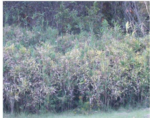
Figure 2. Stand of giant cane ( Arundinaria gigantea ). Photo taken on tribal lands of the Mississippi Band of Choctaw Indians, 2011.

shafts, blowguns (Figure 3) and darts (Figure 4) for hunting squirrels, rabbits, and various birds (Bushnell 1909; Hamel and Chiltoskey 1975; Speck 1941; Kniffen et al. 1987). Young Cherokee boys used giant cane blowguns armed with darts to protect ripening cornfields from scavenging birds and small mammals (Fogelson 2004). The Choctaw used the butt end of a cane, where the outside skin was thick, as a knife to cut meat, or as a weapon (Swanton 1931). Tribes of Louisiana made flutes, duck calls, and whistles out of cane (Kniffen et al. 1987). Cane is best harvested in the fall or winter (October to February) for blow guns and flutes, and plant stems, known as culms, are selected from mature, hardened off plants with larger diameters.