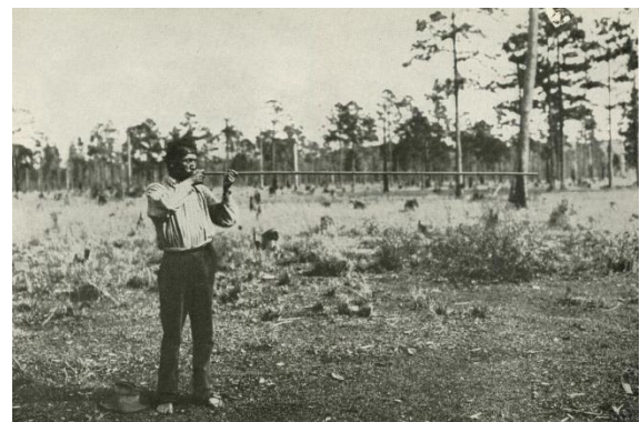
Figure 3. A Choctaw man demonstrating how a blowgun is positioned for shooting. The blowgun is about 7 feet in length and made of a single piece of giant cane.